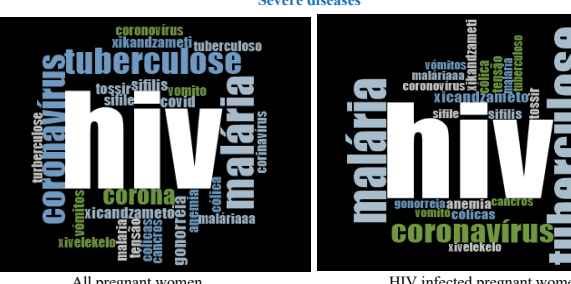
HIV infected pregnant