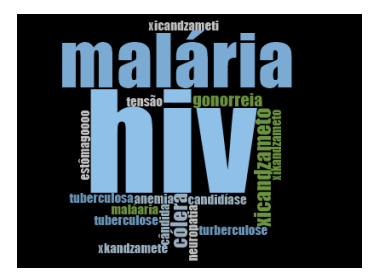
HIV uninfected pregnant women