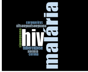
HIV uninfected pregnant women