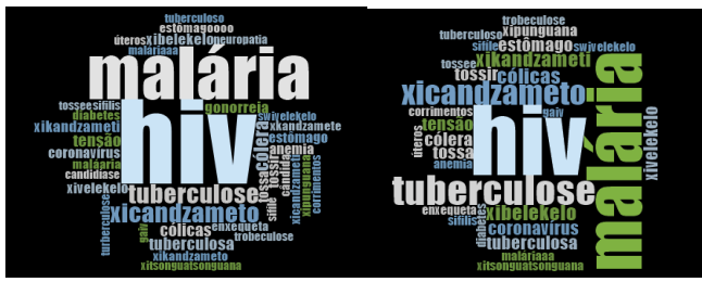
HIV infected pregnant womer

Nhampossa T, et al., Obstet Gynecol Res 2023 DOI:10.26502/ogr0117