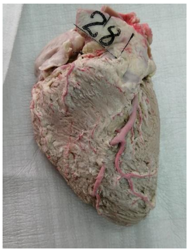
Fig. 2: Myocardial bridge.

6.7% (2/30) of the hearts had two bridges located in the anterior and posterior interventricular artery All bridges were located in the anterior interventricular artery, except for one case that was located in the posterior interventricular artery