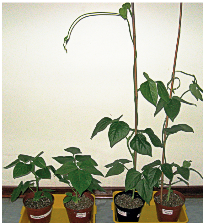
Figure 1: Cowpea landraces after plants at the third foliar stage were maintained for two weeks under well-watered conditions (right) or exposed for two weeks to drought conditions (left) by withholding water

When plants were grown in a temperature-controlled greenhouse in vermiculite under either well-watered or drought conditions (Figure 1), leaf biomass decreased significantly ( p \leq 0.05 ) in all landraces after exposure to drought (Figure 2a). In comparison, root biomass significantly ( P \leq 0.05 ) increased, except for Tete-2, in all landraces as a response to drought treatment. When nodule performance was measured, nodule biomass, nodule number and SNF were significantly ( p \leq 0.05 ) lower in drought-treated than in well-watered landraces (Table 1). When comparing individual landraces, drought-treated